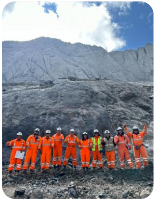
Roberto Letts Tunnel