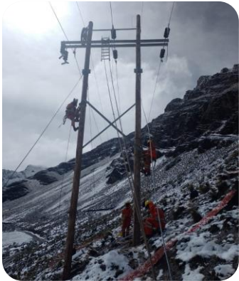
Yanahuin Transmission Line